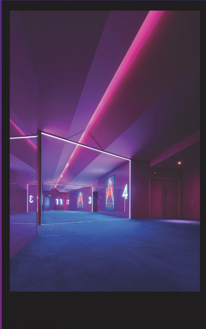
A Cinema in 4 Zones with Skyfall